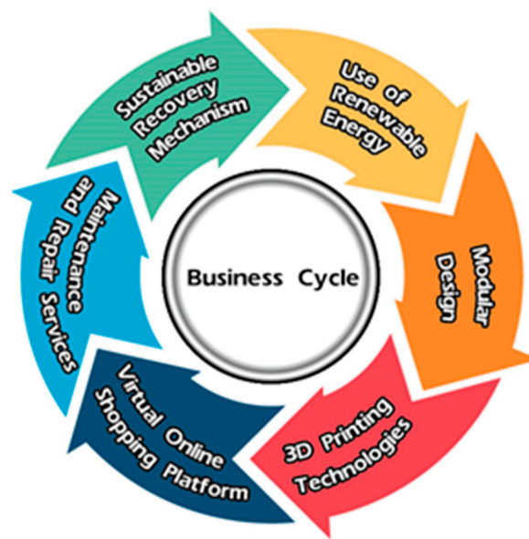
Figure 4. Chyhjiun Jewelry's circular business model.