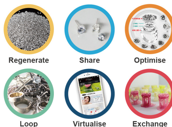
Figure 3. Chyhjiun Jewelry’s developable ReSOLVE business model diagram.